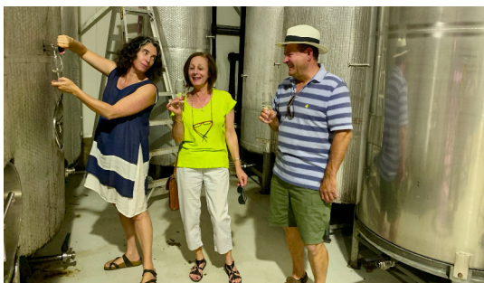
lyzlb1ueLP tank smaple